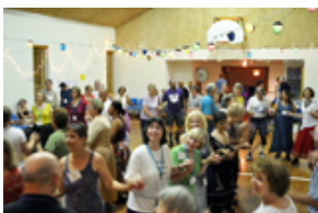
Ethnic Folk Dance Parties