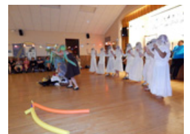
Folk Dance Olympics