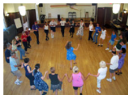
Ethnic Dance Workshops