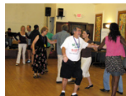
Contras & Squares