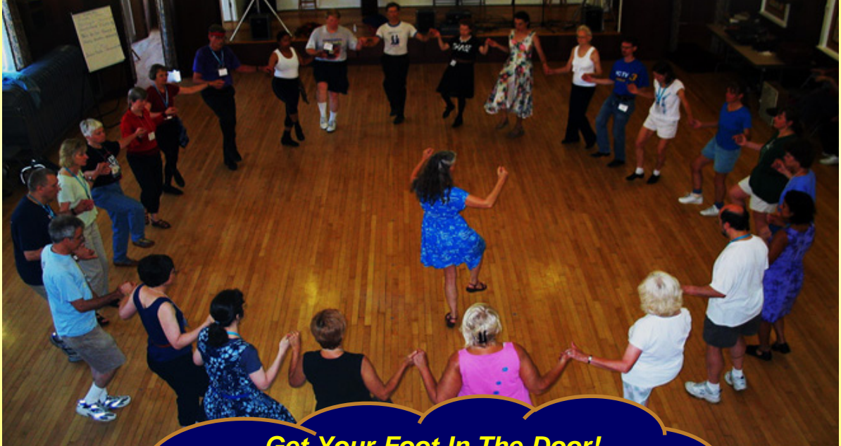
Get Your Foot In The Door! Friday thru Sunday July 12 – 14, 2024

Friday 12:30pm to 11:30pm CDT Saturday 9:00am to 11:30pm CDT Sunday 9:00am to 11:00pm CDT